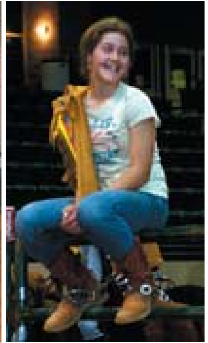
Scenes from Saturday's NYCHA Grand Entry and Junior and Senior Youth Championship Finals.

Finals, until the last two riders knocked him down to fourth.